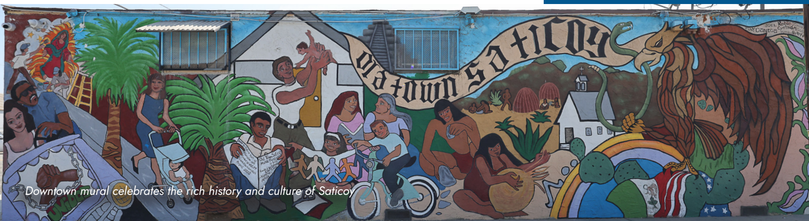
Downtown mural celebrates the rich history and culture of Saticoy

In the end, of the five organizations we supported, three were awarded grants—a win we're thrilled to celebrate alongside our partners.