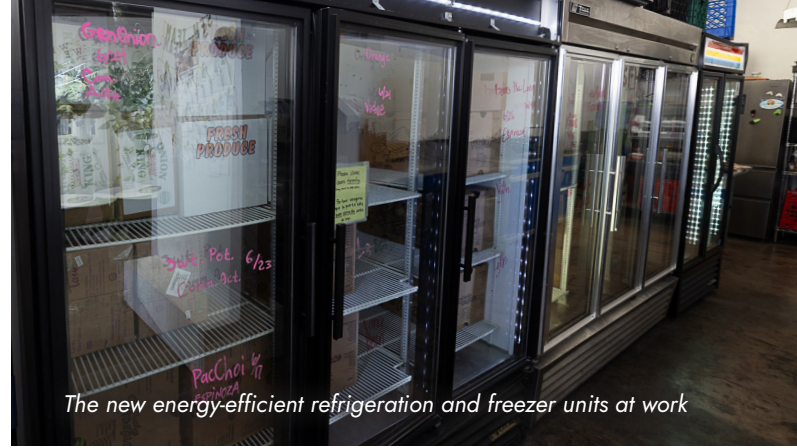
The new energy-efficient refrigeration and freezer units at work

In addition to the Fridge, the Food Hub is continuously working to create programming and services that directly combat food apartheid. These efforts are designed to reach Saticoy's most vulnerable populations—the unhoused, undocumented, senior citizens, and those living in multi-generational households.